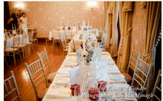
Wedding of Emma & Fionán